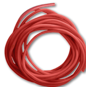
Silicone Rubber Tubing