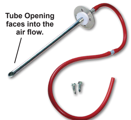
Total Pressure Probe Assembly